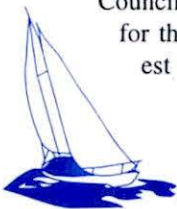
Chart Your Course to Waterland 2001, July 25-29

For more information on the Marina Master Plan, contact the Harbormaster at (206) 824-5700.